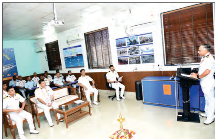
Sharing best practices with FFC on SAR