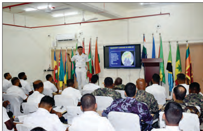
Imparting meaningful Training