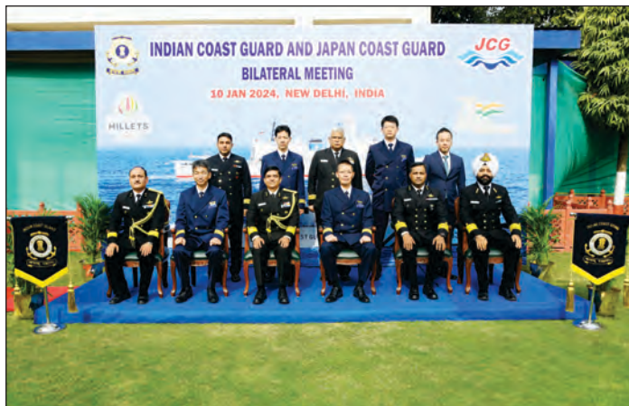
Bilateral Meeting between ICG & JCG