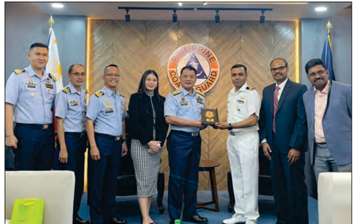
Instilling Confidence in 'Make in India'

Philippines to instil confidence in the platform by exchanging/ sharing the best practices of flying ALH MK-III.