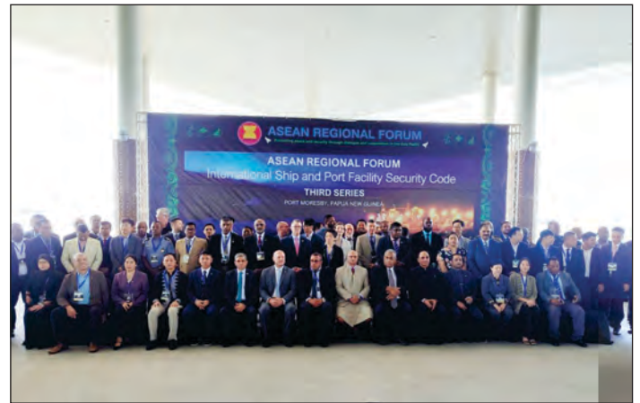
ICG in ASEAN Regional Forum at Papua New Guinea