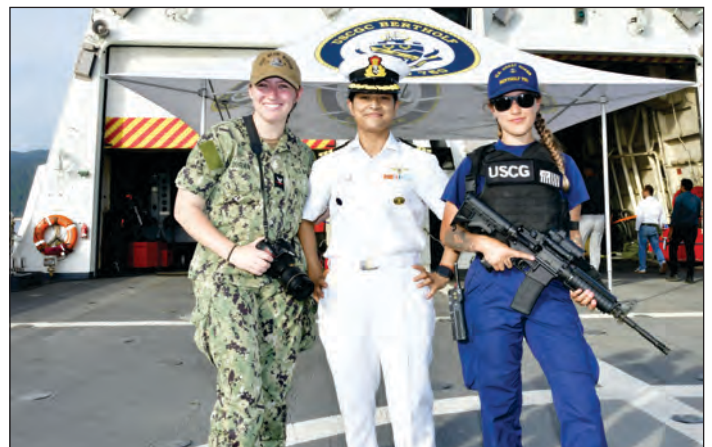
Exercise Sea Defender - 2024 with USCG at Port Blair