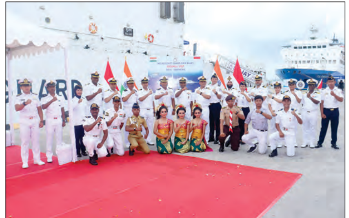
Deployment of ICG Ship for professional interaction at Indonesia and Korea