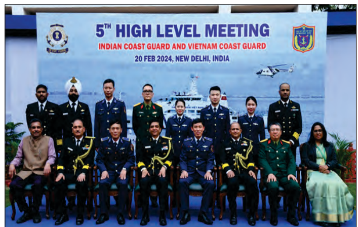
High Level Meeting with VCG