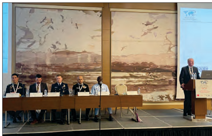
Fostering Cooperation in WBSC-24 at Turkiye

● World Border Security Congress (WBSC)-24 at Turkiye. Two member ICG delegation led by ADG Paramesh Sivamani, PTM, TM, ADG CG participated in World Security Congress-2024 conducted from 24-26 Apr 24 at Istanbul, Turkiye. WBSC is a forum for the meeting of Coast Guards and Border Agencies across the Globe, aimed at fostering cooperation and addressing maritime challenges. ADG CG delivered a lecture on “Maritime Border Challenges” to the congress and discussed potential solutions.