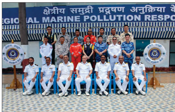
Maiden IMO OPRC Course for ASEAN Countries