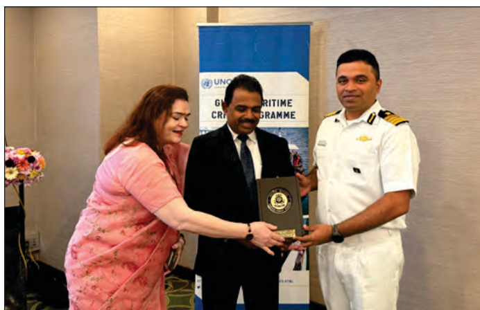
Addressing Drug Trafficking through Coordination