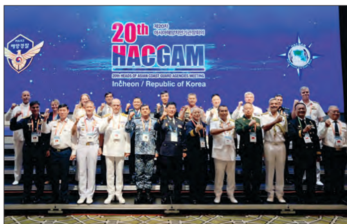
Enhancing Cooperation with members of HACGAM