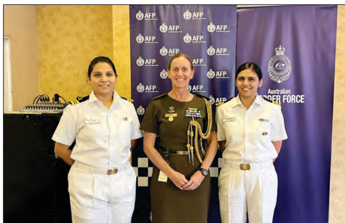
Enhancing the Role of Women in Maritime Security

● Women in Maritime Security Program. Australian National Centre for Ocean Resources and Security, University of Wollongong conducted Women in Maritime Security Program (North Indian Ocean Region) at Colombo, Sri Lanka from 03-06 Jun 24. The workshop was aimed at understanding the nuances of UNCLOS and networking amongst women working in maritime domain. Two ICG Women Officers