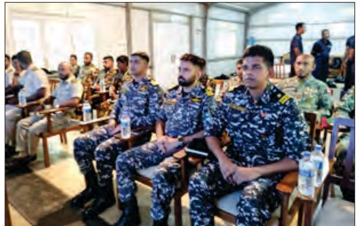
A fight against Global Crime : ICG at GMCP, Sri Lanka

Seizure (VBSS) exercise with a Chemical, Biological, Radiological, and Nuclear (CBRN) event simulation from 21 Oct - 01 November 2024 at Trincomalee, Sri Lanka.