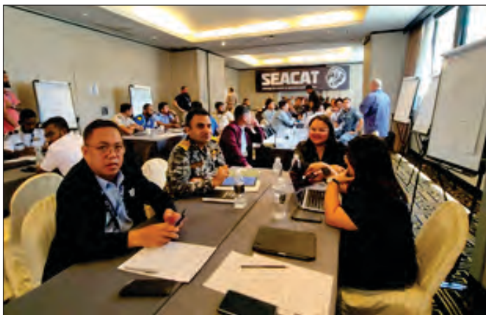
Highlights of SEACAT - 2024