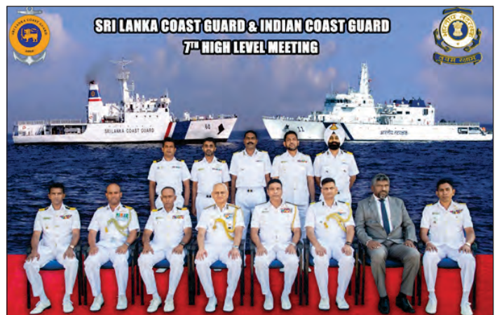
High Level Meeting with SLCG