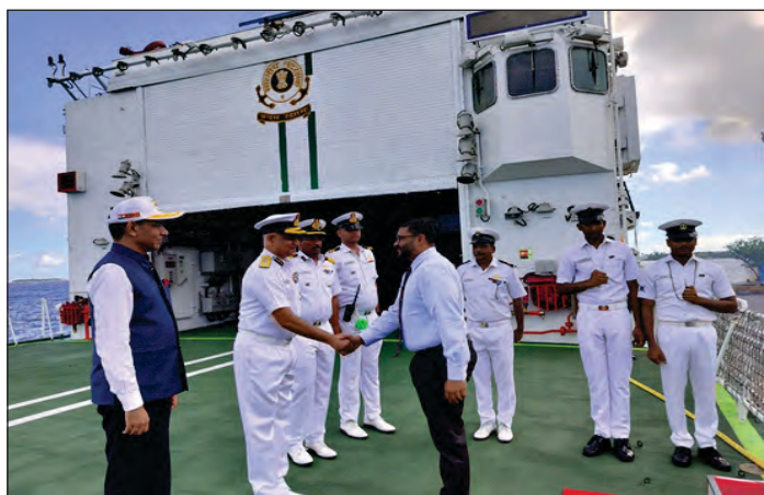
Participation in the 16 th edition of Exercise Dosti