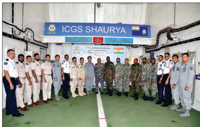
Capacity Building through practical demonstration

Officers and Sailors of Friendly Foreign Countries (FFCs) at Coast Guard Pollution Response Team (East), Chennai in the month of Mar 24 and Nov 24. A total of 19 Officers and 19 PBORs participated in the specialized training.