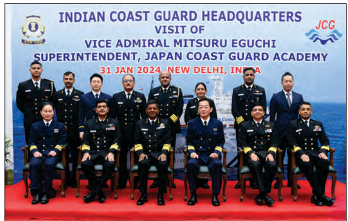
ICG - JCG : Strengthening Education and Training