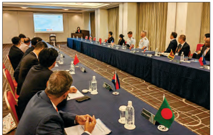
Glimpse of 24 th CBEP ReCAAP at Tokyo, Japan

● 24 th Capacity Building Executive Programme (CBEP) of ReCAAP ISC. The 24 th Capacity Building Executive Programme (CBEP-24) organized by the ReCAAP-ISC was conducted from 21-25 Oct 2024, in Tokyo, Japan. This five-day event, supported by the Japan Coast Guard and the Ministry of Foreign Affairs of Japan, brought together senior officers from various ReCAAP member countries to enhance regional capabilities in combating piracy and sea robbery. One ICG Officer participated in the programme.