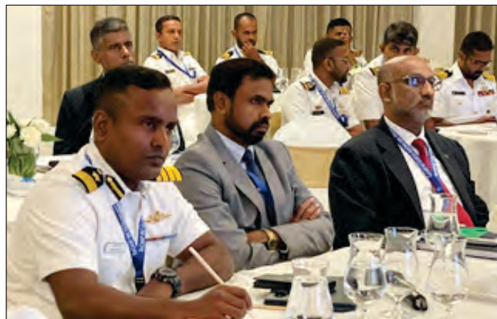
Fight against Piracy : ICG participation in ReCAAP Cluster Meeting

● ReCAAP Cluster Meeting at Sri Lanka. Cluster meeting from 22-25 Jul 24 was initiated by ReCAAP ISC with several objectives that included inter ministerial coordination, engagement of local shipping industries/agencies with the local and neighbouring ReCAAP Focal points to localize challenges in the effort to suppress piracy and armed robbery against Ships in