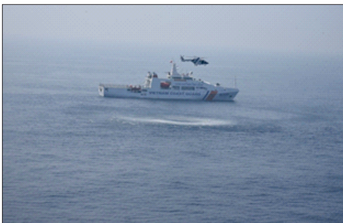
ICG-VCG Joint Exercise 'Sahyog Hop-Tac-2024' at Kochi

Major Fire-Fighting demonstration, Oil Pollution Response, and vertical replenishment operations.