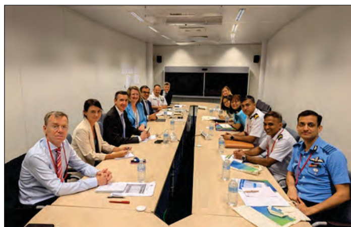
CSDP Meet at Belgium and Spain