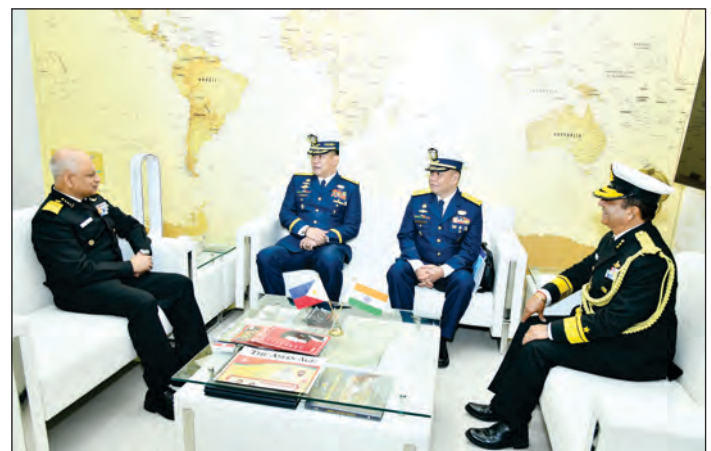
Bilateral Meeting with Philippines Coast Guard