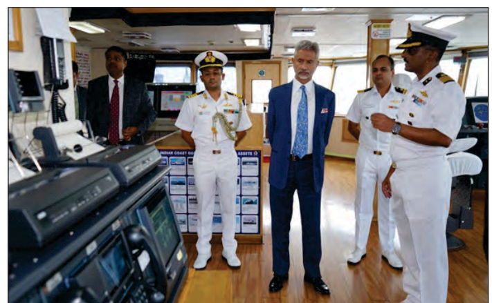
ICG furthering India - ASEAN Initiative