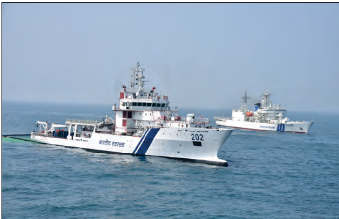
Enhancing Interoperability : ICG-JCG Joint Exercise