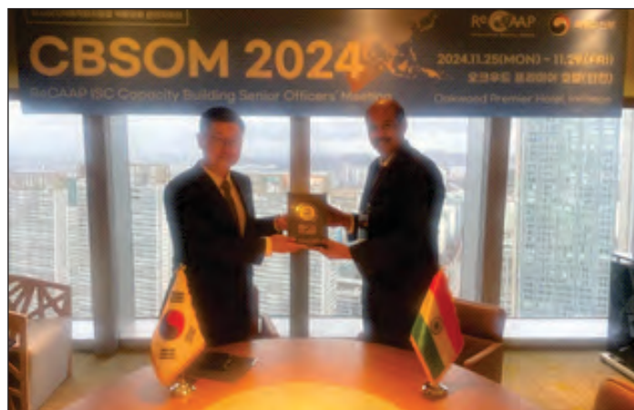
Enhancing best practices to combat Security Challenges

One ICG led composite delegation participated in ReCAAP ISC capacity Building Senior Officer Meeting-2024 (CBSOM-24) held from 25-29 Nov 24 at Incheon South Korea.