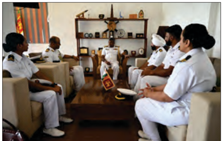
Interaction for future collaboration