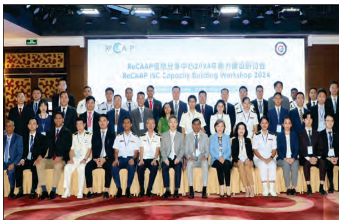
ICG participation in ReCAAP CBW-2024 at China

● ReCAAP ISC Capacity Building Workshop-2024. The annual ReCAAP ISC Capacity Building Workshop (CBW) 2024 was held at Guangzhou, China from 03-06 Jun 24. The workshop provided an insight on the online incident reporting system of the ReCAAP ISC and enriched knowledge on the trend of piracy and