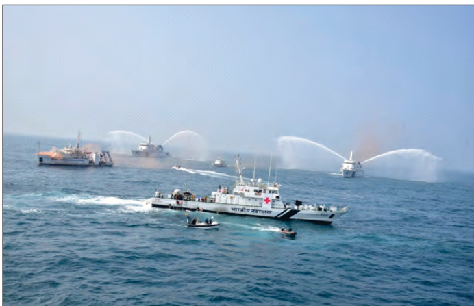
Augmenting Interoperability and skills through training

The exercise at sea focused on contemporary maritime security situations, SAR operations and Major Fire-Fighting demonstration.