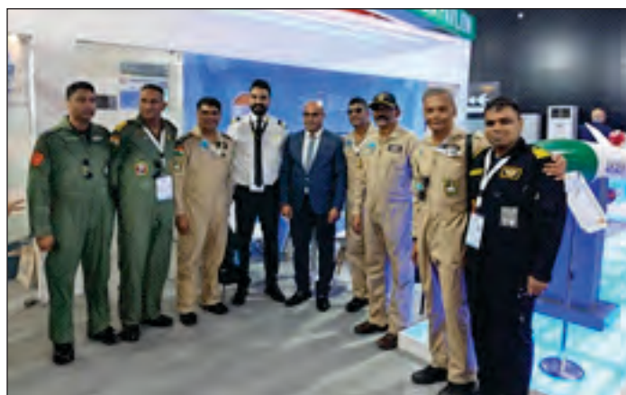
Showcasing ICG Capabilities : EIAS, Alexandria, Egypt