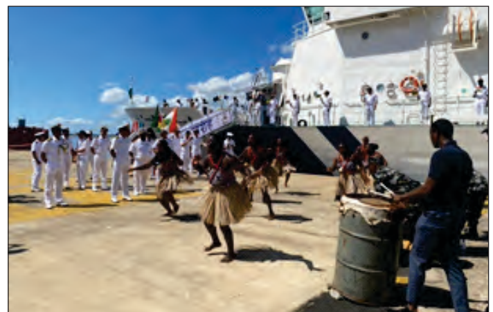
Enhancing Cooperative engagements with African countries