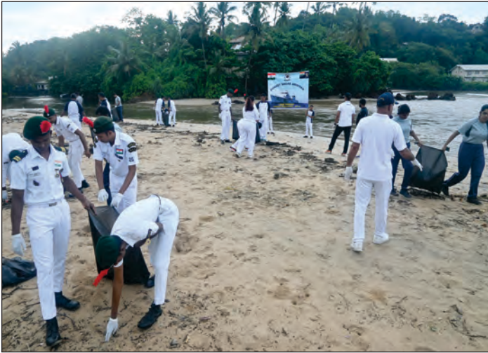
Professional exchanges of ICG ship during OSD to Sri Lanka