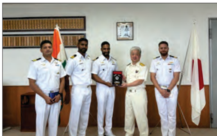
Honing Skills and Knowledge : RDDW-24, Kure, Japan