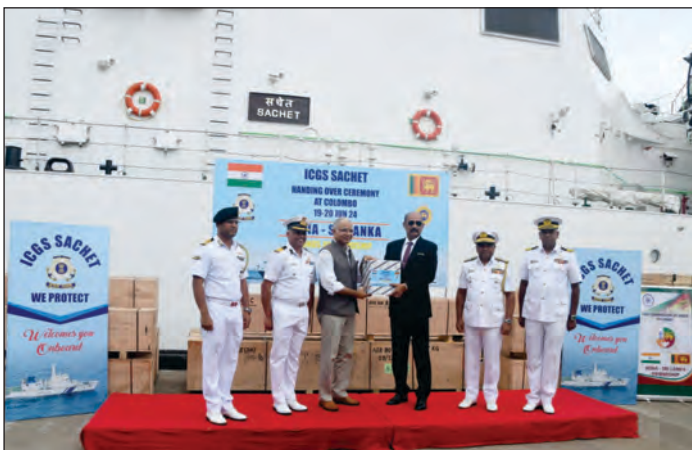
Enhancing Defence ties : ICG Ship visit to Sri Lanka

Various co-operative engagements, Training and capacity building activities were undertaken during the visit. As maiden initiative, 02 ICG women Officers were embarked onboard ship highlighting and emphasising role of women in Maritime Security & Safety. Additionally, 10 NCC cadets were also embarked onboard under the overseas exchange programme to participate in the initiative "Puneet Sagar Abhiyan".