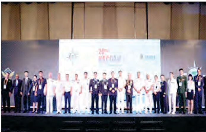
Glance at activities at WLM of 20 th HACGAM

● Working Level Meeting (WLM) of 20 th Heads of Asian Coast Guard Agencies (HACGAM). As prelude to the High Level Meeting of 20 th HACGAM scheduled in Sep 24 in South Korea, a Working Level Meeting was held from 17-20 Jun 24 at Incheon, South Korea. One ICG Officer participated in the WLM.