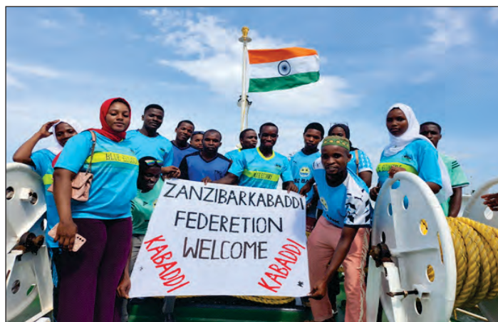
Enhancing Cooperative engagements with African countries

● Overseas Deployment of ICGS Samarth and ICGS Abhinav to IOR Countries. Indian Coast Guard Ships Samarth (with integral Helo) and Abhinav visited Maldives and Sri Lanka from 20 Feb - 07 Mar 24. As part of the OSD, ICGS ships participated in the 16 th edition of trilateral exercise DOSTI among India, Maldives and Sri Lanka. The exercise was witnessed by H.E. Mohamed Ghassam Maumoon, Minister of