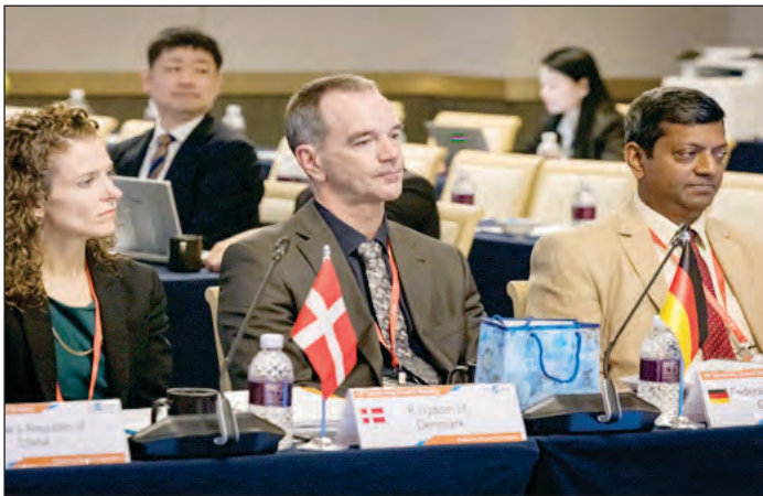
18 th ReCAAP Governing Council Meeting